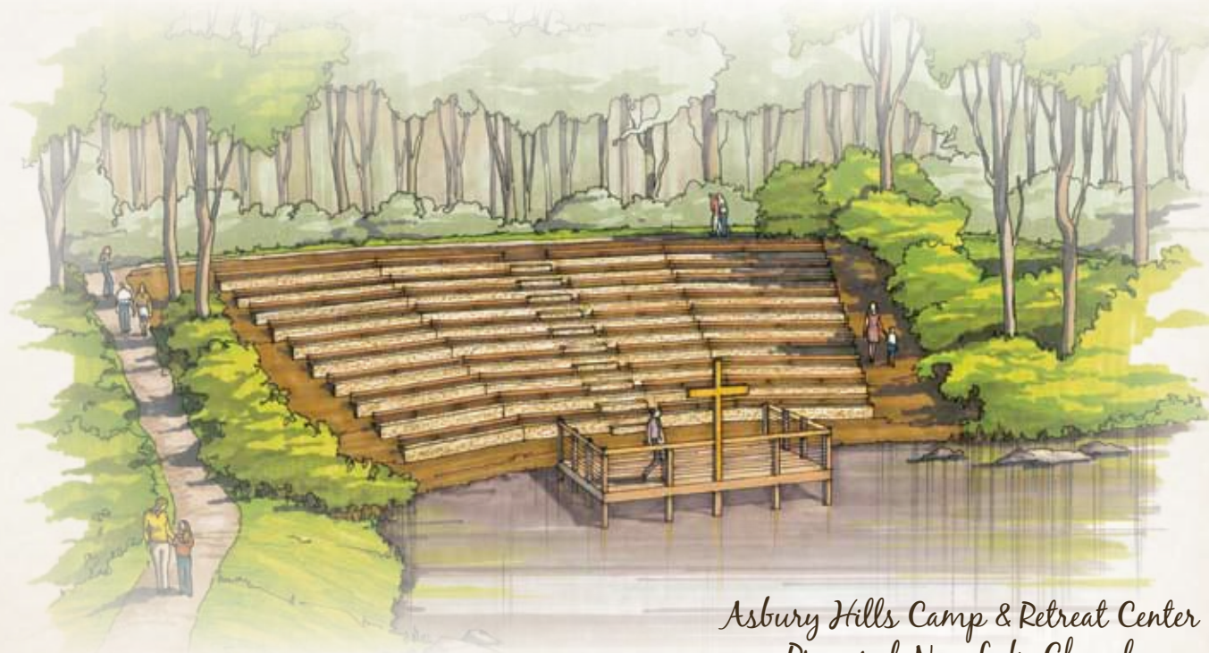
Asbury Hills Camp & Retreat Center Proposed New Lake Chapel